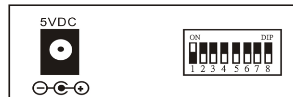
Figure 3. CVT-2112 Series Rear Panel